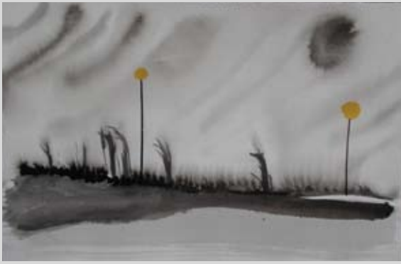
Udo Haufe Title: Landscapes & Dreams III Technique: Collage Size: 27 x 40