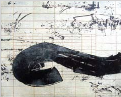
Bärbel Voigt Title: Schnittstelle Technique: Color Etching Year: 2007 Size: 40 x 50 cm