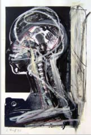
Stefan Voigt Title: Taktmuster 02 Technique: Drawing Over Silk-Screen Year: 2005 Size: 60 x 42 cm