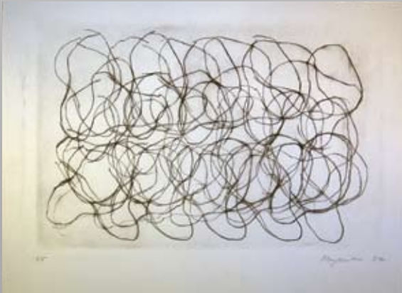
Jana Morgenstern Title: Stein III Technique: Lithograph Year: 2007 Size: 39 x 57 cm

Ohio Arts Council A STATE AGENCY THAT SUPPORTS PUBLIC PROGRAMS IN THE ARTS