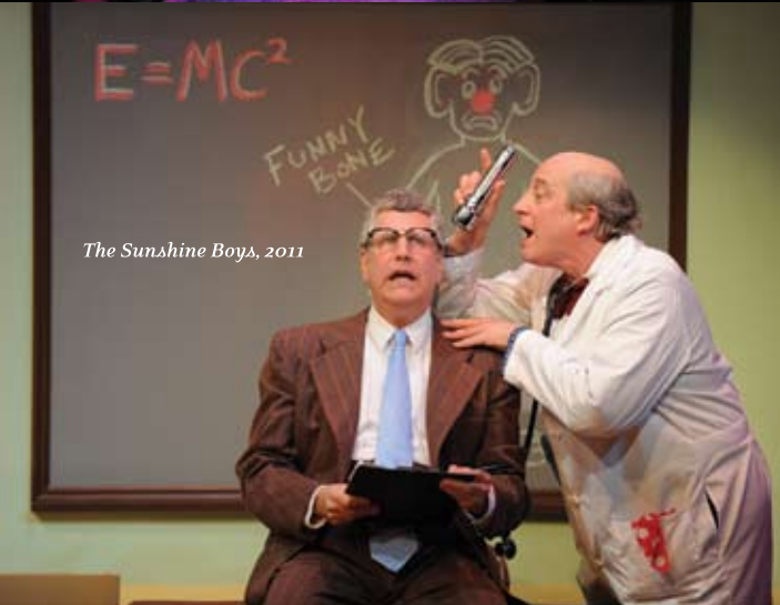
The Sunshine Boys, 2011