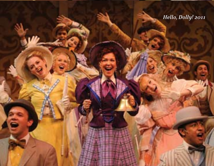
Hello, Dolly! 2011